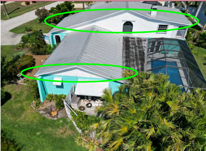
SHOWING WEST GABLE END OF THE HOUSE.