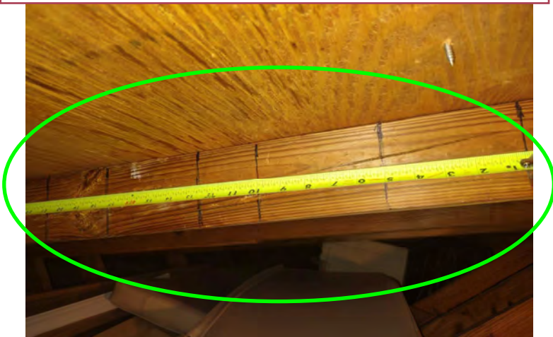
SHOWING NAILING PATTERNS OF 6 INCHES OR LESS ON THE ENDS.