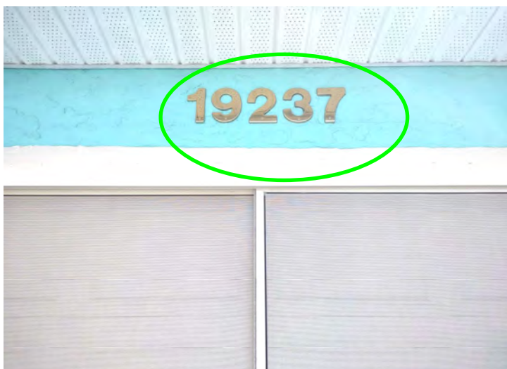
SHOWING ADDRESS VERIFICATION.