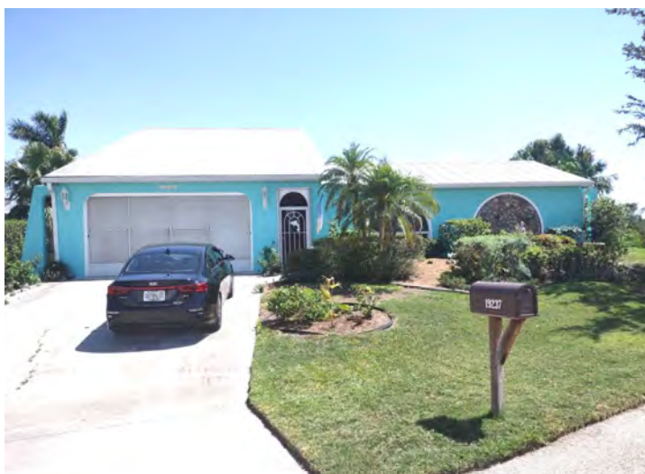
SHOWING NORTH FRONT ELEVATION OF THE HOUSE.