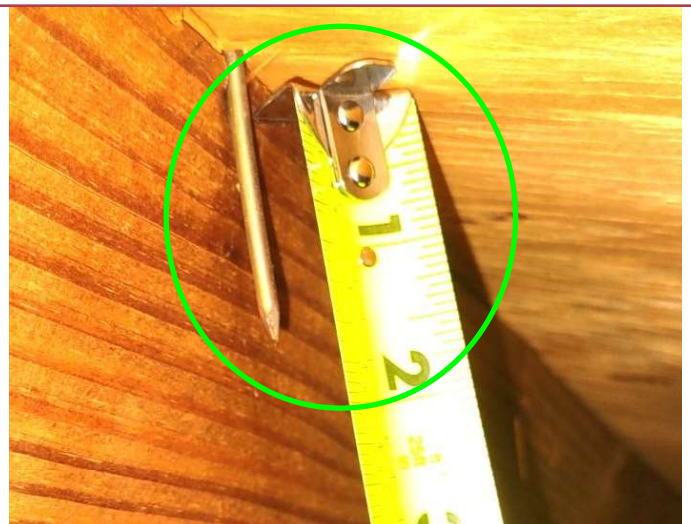
SHOWING 6 D NAILS SECURING THE PLYWOOD DECKING TO THE TRUSSES.