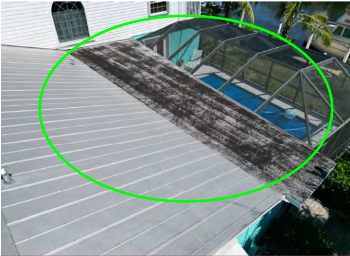
SHOWING FLAT ROOF SECTION.