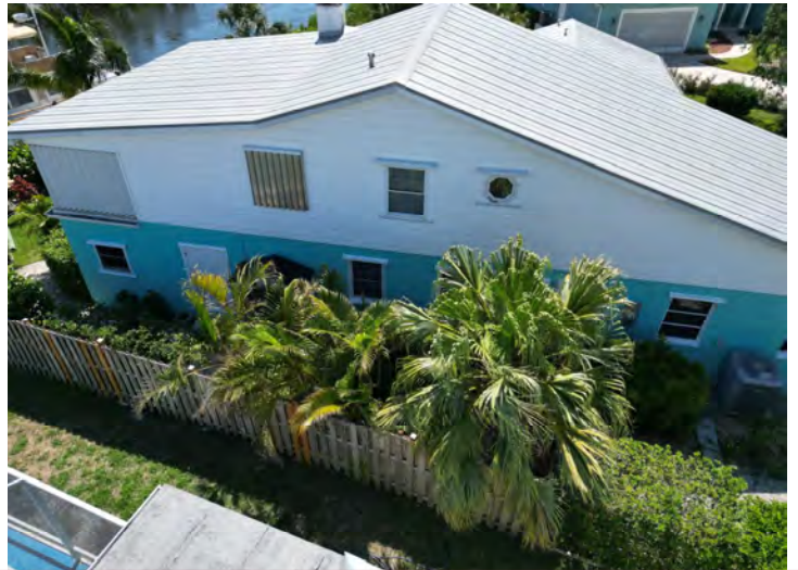
SHOWING DIFFERENT VIEW OF THE EAST GABLE END OF THE HOUSE.