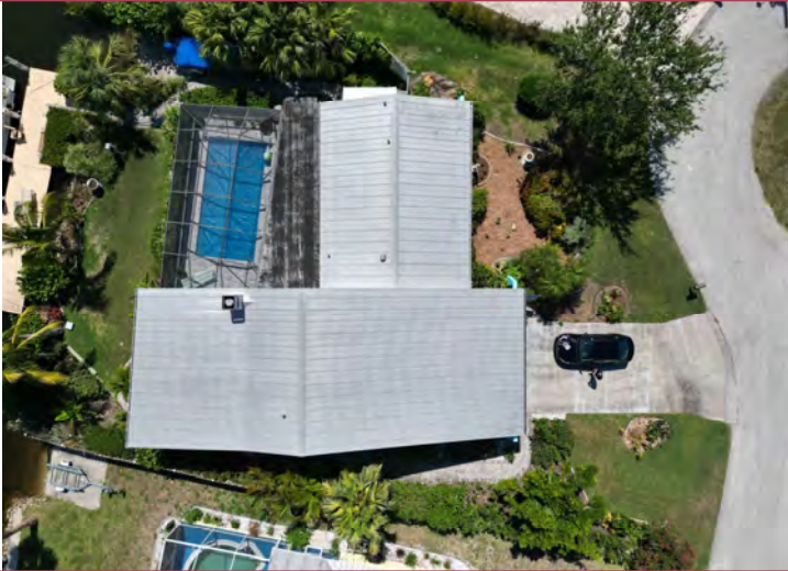
SHOWING OVERVIEW OF THE HOUSE AND ROOFING SYSTEM.