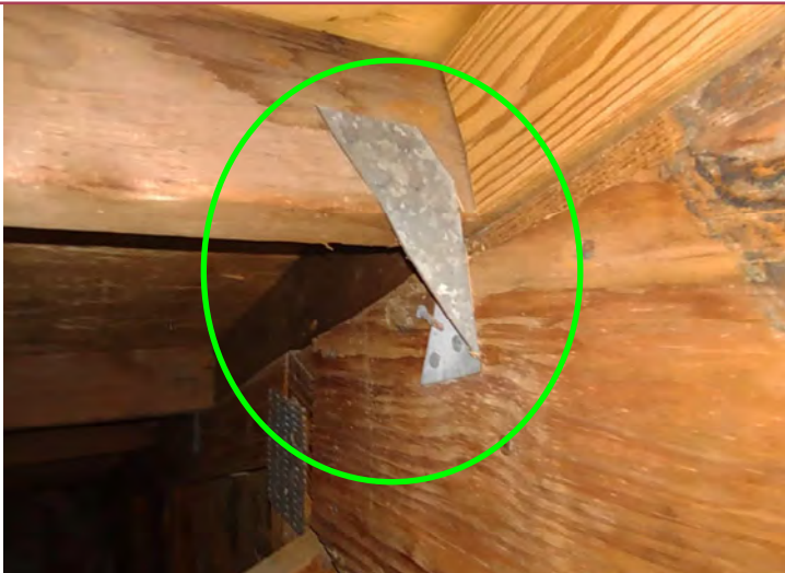
SHOWING PROPERLY INSTALLED HURRICANE CLIP.