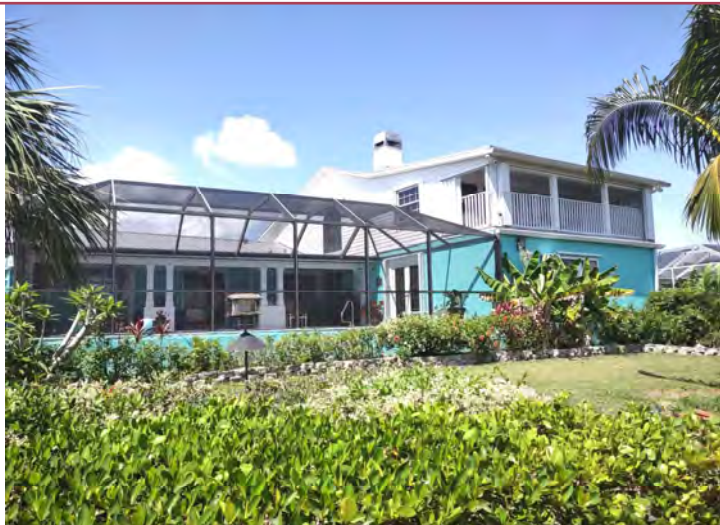
SHOWING SOUTH BACK ELEVATION OF THE HOUSE.