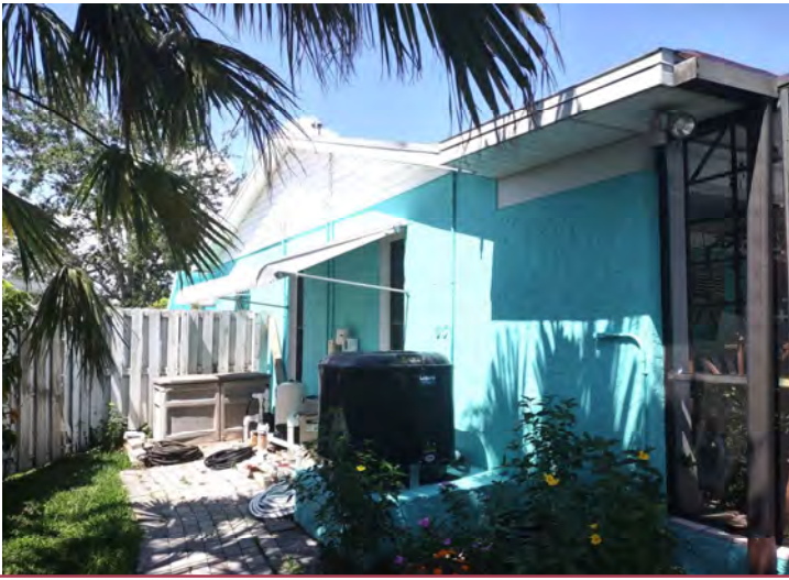
SHOWING FRONT WEST SIDE ELEVATION OF THE HOUSE.