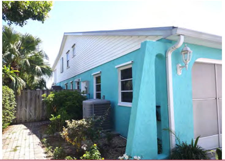
SHOWING EAST SIDE ELEVATION OF THE HOUSE.