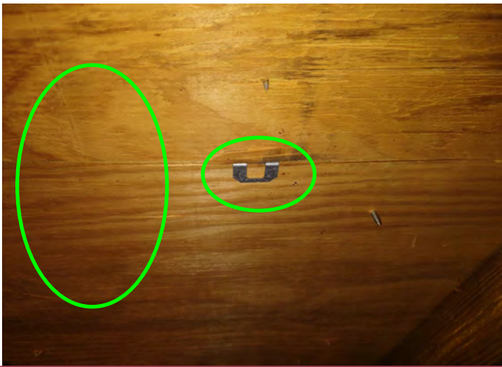
SHOWING PLYWOOD SHEATHING USED AS ROOF DECKING AND H-CLIPS FOR END SUPPORT.