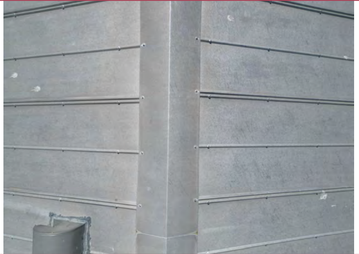
SHOWING CLOSEUP OF THE RIDGE CAP AND FASTENERS.