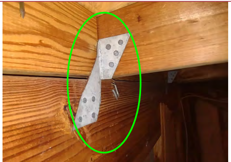
SHOWING PROPERLY INSTALLED HURRICANE CLIP.