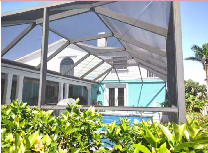
SHOWING WEST SIDE BACK ELEVATION OF THE HOUSE.

Inspectors Initial S.E. Property Address _____