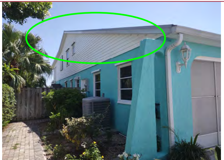
SHOWING EAST SIDE GABLE END OF THE HOUSE.