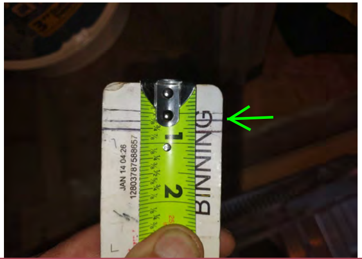
SHOWING MEASUREMENT OF THE PLYWOOD IS ACTUAL 5/8 INCHES THICK.